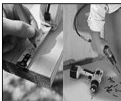
Dave Pullen Handyman Services