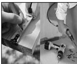
Dave Pullen Handyman Services