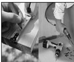
Dave Pullen Handyman Services

Similarly, the Commission now believes that the Winter-